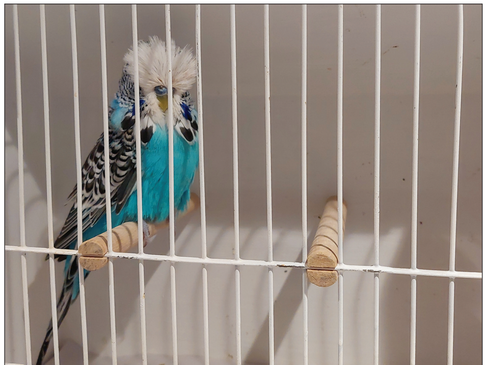
The winning Sky Blue Cock.